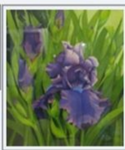
Moment of Grace