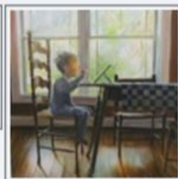
Waiting for Breakfast