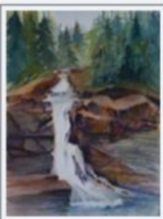
A Powerful Force