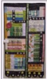
Warp and Weft