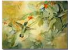
Watercolor and Ink Originals