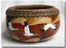
Gourd Art and Baskets